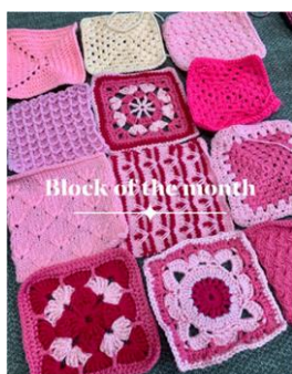
A sample of the squares all ready to go for 'Pink-tober'!

Thank you for everything you do on behalf of GoG! 💕